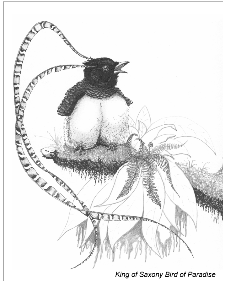
King of Saxony Bird of Paradise

Today we are bombarded with countless images of visually stunning birds. Among the shiny metallic pheasants, paintbox-coloured parrots and glistening hummingbirds, one family stands out: the birds of paradise. It was not surprising, therefore, that customers visiting our stand at the Birdfair voted Papua New Guinea as their number one dream destination.